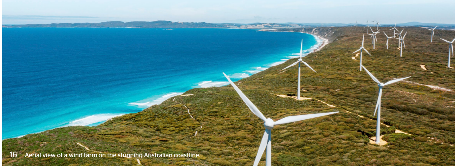
16 Aerial view of a wind farm on the stunning Australian coastline.