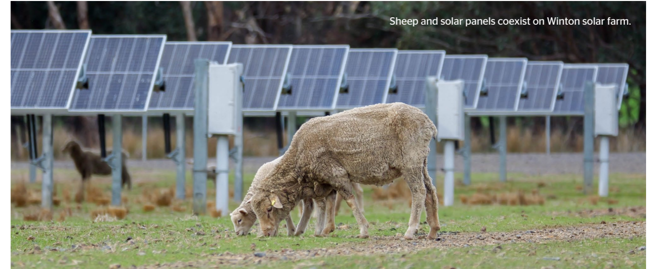
Sheep and solar panels coexist on Winton solar farm.