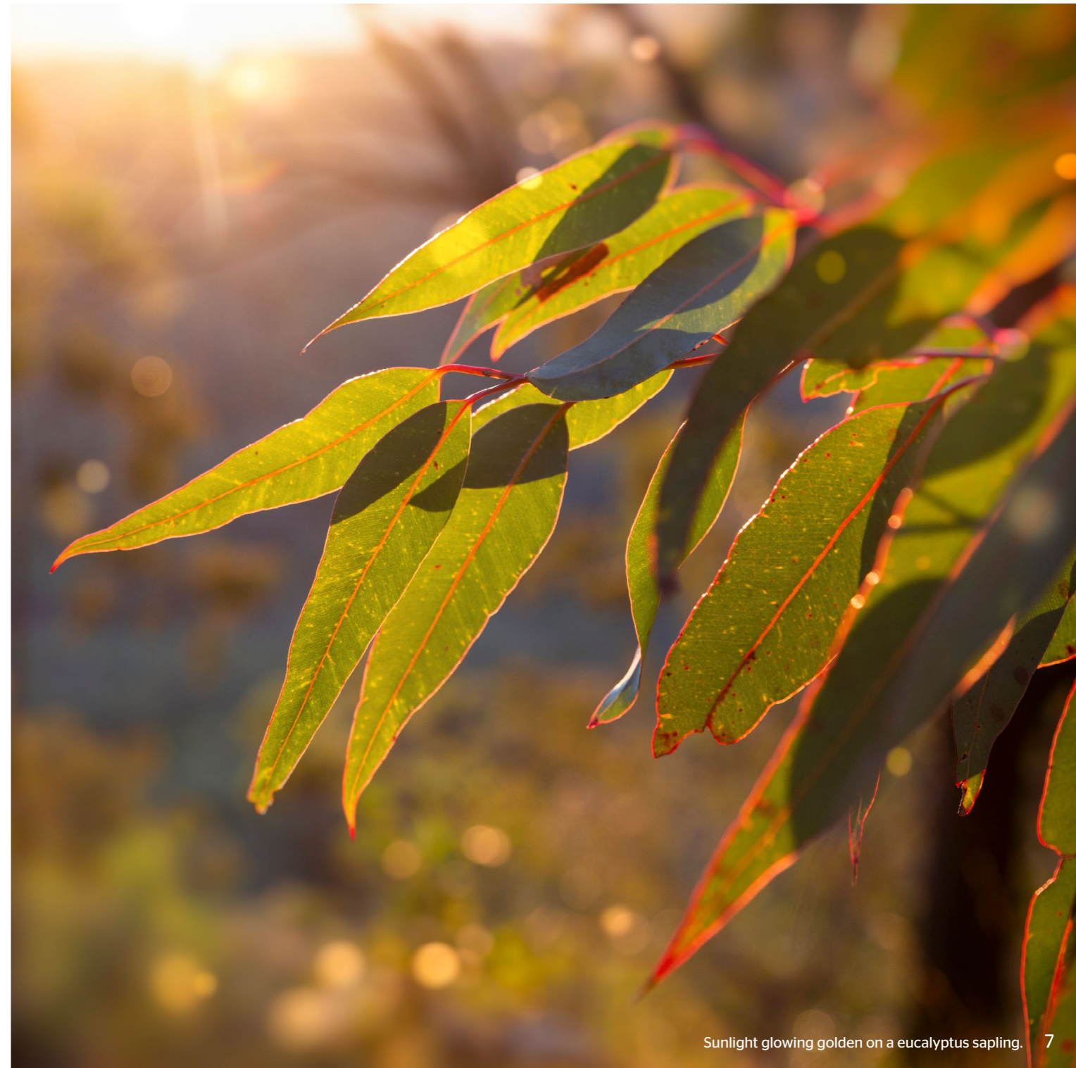
Sunlight glowing golden on a eucalyptus sapling.