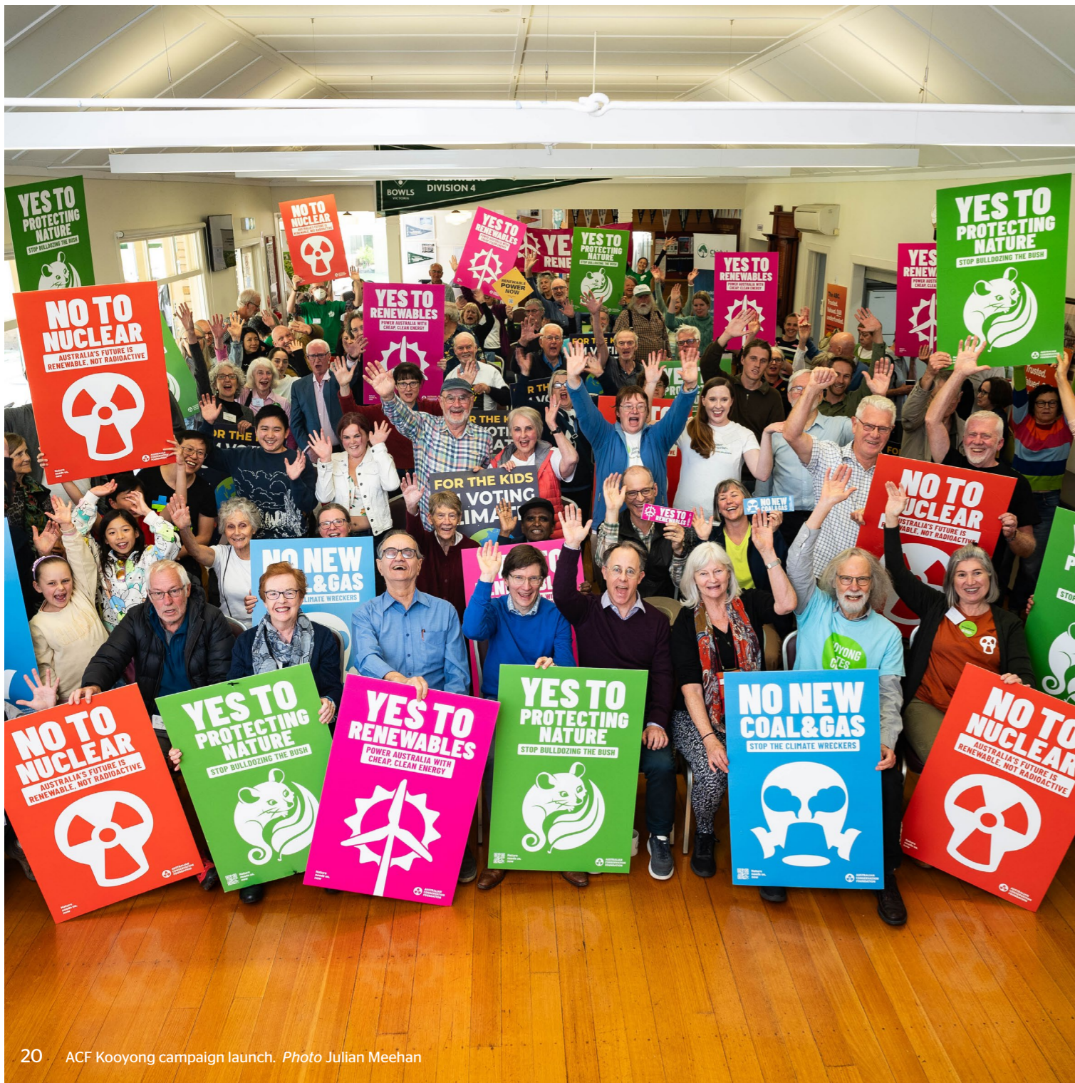
20 ACF Kooyong campaign launch.