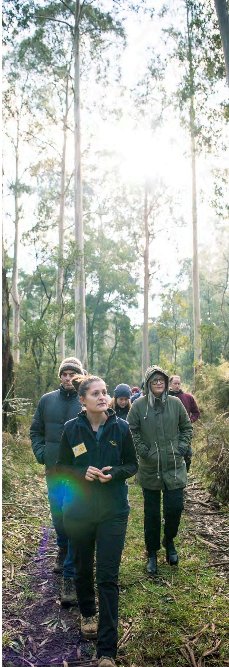
Right. Bushwalkers, Victoria.

This connection with local bushland often extends to a sense of care and protection, especially when favourite places are threatened by yet more urban sprawl, pollution and industrialisation. That's why local people across the country are organising their communities to protect and restore urban habitat, and the threatened species which survive there.