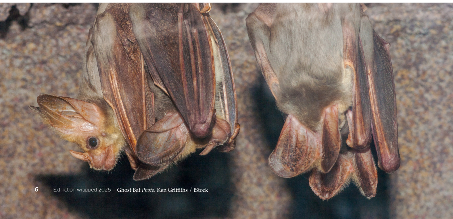
6 Extinction wrapped 2025 Ghost Bat

Read more about the data sources and methodology behind Extinction Wrapped 2025.