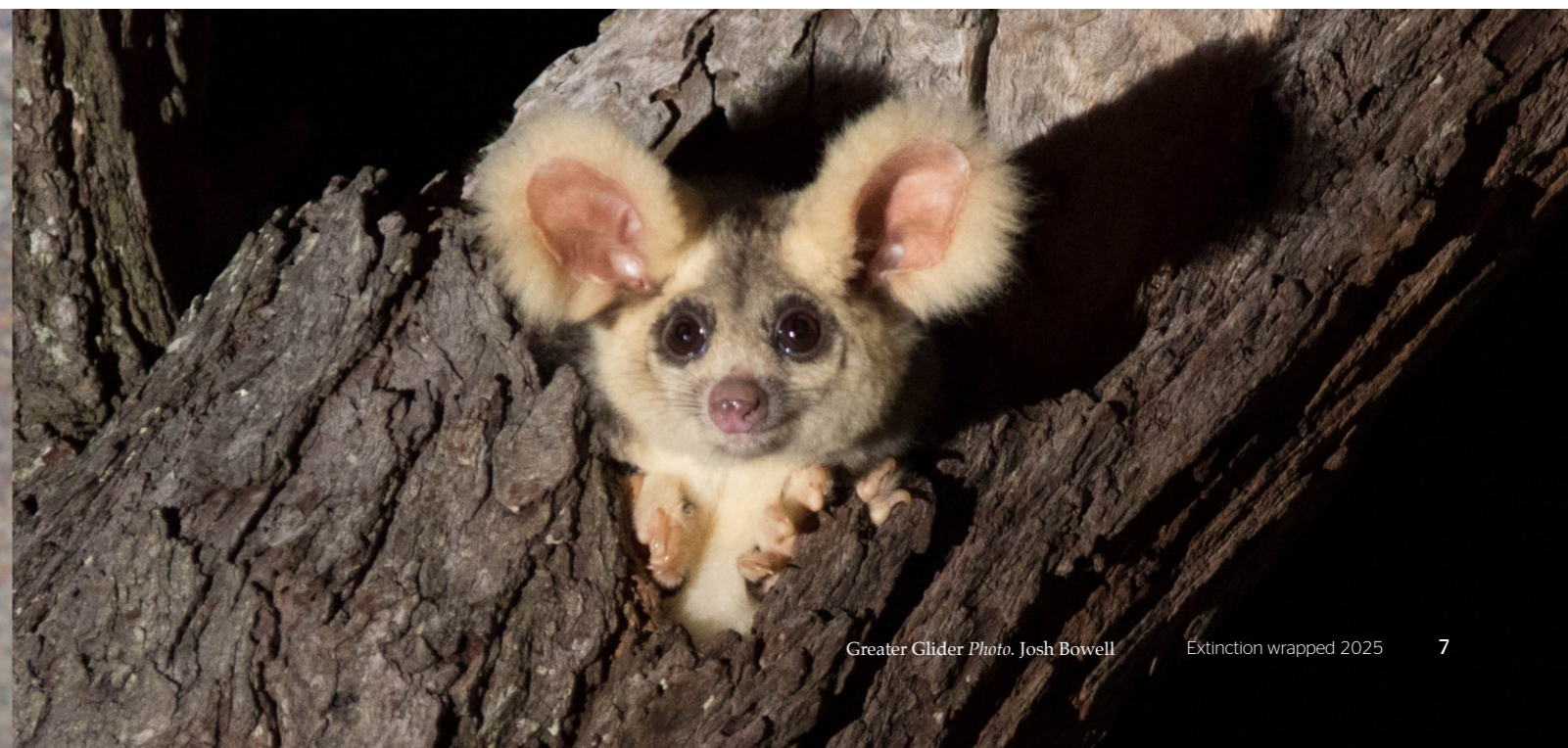
Greater Glider Photo. Josh Bowell Extinction wrapped 2025 7